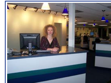
Our medical office building lobby on Springport road gets a makeover, improving patient care and access.

Our new lobby is designed with our patients comfort as our primary concern. We removed the glass barrier between our patients and our staff. Kiosks