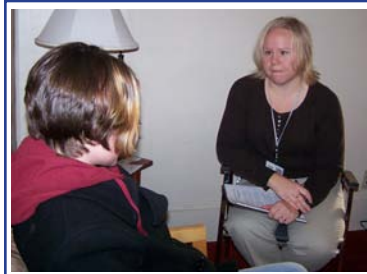
Interfaith Health Center begins providing mental health services.

We have currently provided mobile dental services to