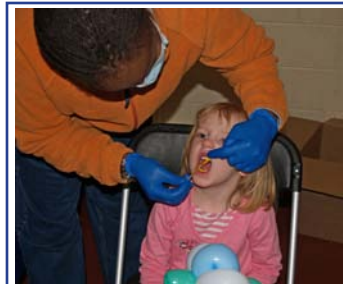
Mobile dental program begins.

Dibble School, Cascades, McCulloch, and the Martin Luther King Center and are continuing to expand services.