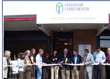
Teen Health Center at Parkside opens, serving youth, 11 - 21.

assessments, care for youth when they are ill and health education which will focus on their needs including body image, nutrition, drug and alcohol abuse prevention, counseling services and crisis intervention.