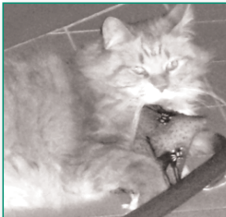
(Right) WINSTON: Quirky and lovable