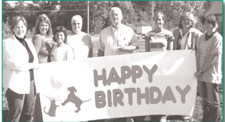
Staff and volunteers celebrate five years of operation at our Adoption Center.